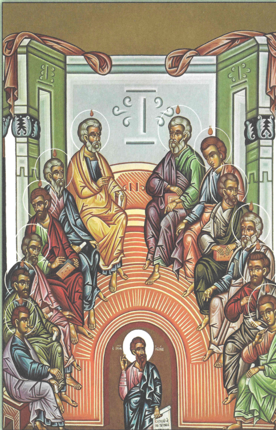
Icon of Pentecost